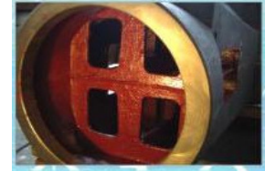
COLUMN: box structure, increase rigidity

Tempered and Carburized Chrome Molybdenum Steel Spindle NSK or Nachi ABEC-7 Angular Contact Precision Spindle Bearings R8, NT30 or NT40 Spindle Tapers - Factory Tested To 0.0004" TIR Ram Rotation (Deg) 90 left/right, 0-45 front/back*, 360 Orbital Induction Hardened & Precision Ground Table & Ways PBC-2 Phosphor Bronze Backlash Adjustable Lead Screw Nuts Full Length Precision Ground Gibbs with Double End Adjustments Turcite-B X&Y Saddle Ways - Precision Hand Scraping Throughout