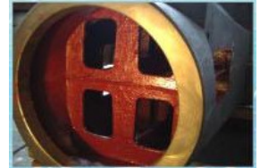
COLUMN: box structure, increase rigidity

Manual 1-Shot Lubrication System - Automatic Optional 35 Watt Halogen Work Lamp - 50 Watt Optional Draw Bar, Tool Box With Operation Manual And Test Data Includes Leveling Pads - Lift Eye - Rear Ram Eye SC250 Superior Rigidity - Uniquely Structured Castings