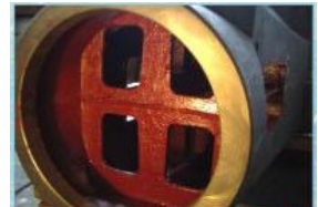
COLUMN: box structure, increase rigidity

Manual 1-Shot Lubrication System - Automatic Optional 35 Watt Halogen Work Lamp - 50 Watt Optional Draw Bar, Tool Box With Operation Manual And Test Data Includes Leveling Pads - Lift Eye - Rear Ram Eye SC250 Superior Rigidity - Uniquely Structured Castings